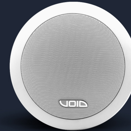
Cirrus 6.1 A passive 6.5" two-way, full range ceiling speaker.