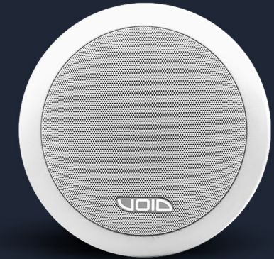
Cirrus 4.1 A passive 4" two-way, full range ceiling speaker.